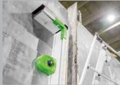
1. Shuttering with FaMe