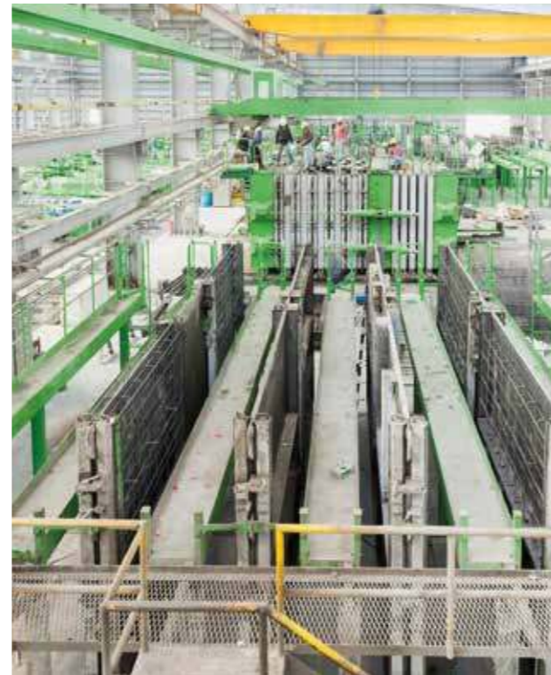
Cold shutter system in use