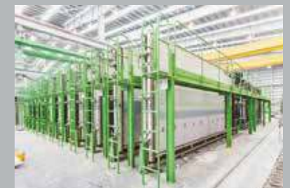
5. Final Curing