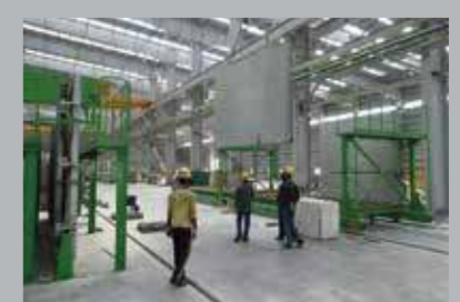
6. Lifting to storage