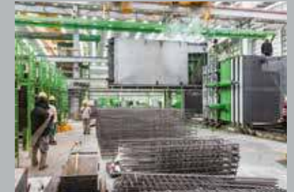
4. Lifting of pre-cured panels