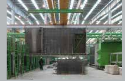
2. Lifting of cold shutter