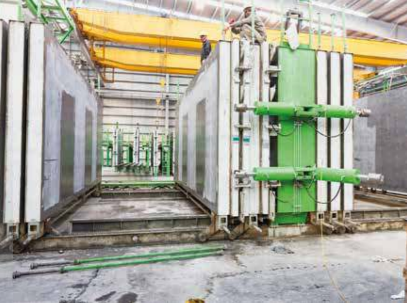
Casting to desired size with smart side forms