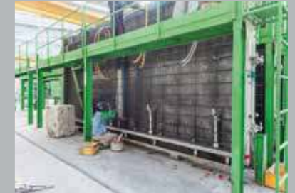
1. Shuttering, reinforcement, inserts