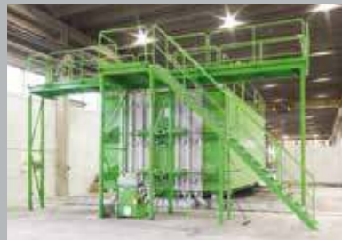
4. Curing with heating system