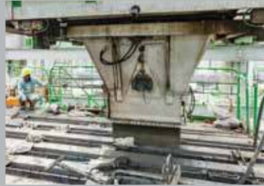
3. Casting and Compaction