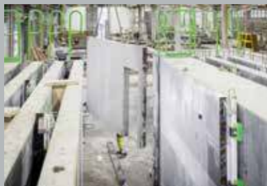
6. Lifting to storage