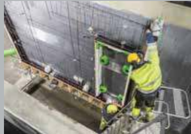
2. Reinforcement and Inserts